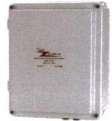
VOT BD or VOT RC